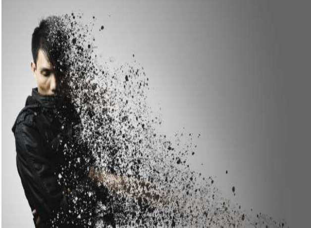
Fig. 3: Disintegration from human to cloud of particles

legs,” the husband pointed out, looking at the slim ankle. “My wife has great legs.” (Le Guin, 1982).